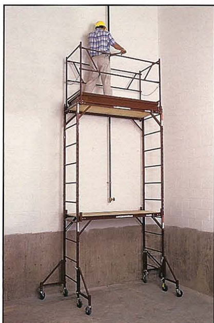
Part No. 0172-1006-2 6'H Double Scaffold Pkg. with Casters, Guard Rail, and 18" Outriggers - 12'H

The original mobile utility scaffold - the baker ™ Scaffold - is one of the most popular single pieces of maintenance equipment in the world! Its dependability and versatility make it indispensable to thousands of contractors. The baker ™ Scaffold is also used extensively for maintenance work in office buildings, industrial plants, institutions, malls, churches, and government buildings.