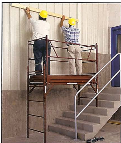
Part No. 0172-1006-1 6'L Scaffold Pkg. with Casters and Guard Rail - 6'H