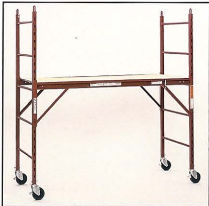
Part No. 0172-1006-0 6'L Scaffold Pkg. with Casters - 6'H

- Available in 6', 8', and 10' Lengths - All units are 30-1/2" Wide