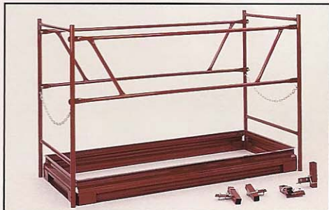
Part No. 0172-6606 - 6'L Guard Rail System*

* Shown with 6" Steel Toeboards. Can be purchased without toeboards. See price list for details.