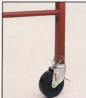
Part No. 0026-072 - 5" Caster

All baker II Scaffolds feature a powder coated finish. An environmentally friendly process, powder coating is the finest metal finishing technology available today.